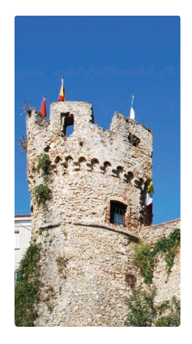
On this page, above: Lookout tower at the entrance to the Village. Below: Access door to the Village from the so-called "Belvedere della Torretta". On the opposite page: View of the Trabucco, an ancient wooden building used by the Termolesi to fish without using boats.

Built between the 10th and 11th centuries and reorganized by Frederick II of Swabia in the 13th century, it had, in addition to the Castle, six sighting towers. Of these towers remain the tower located at the entrance of the Old Village and the ruins of Torre Tornola, while some pieces of circular masonry are found in the building adjacent to the port. The ruins of Torre Tornala were the subject of archaeological investigation and restoration in 1981. The City walls are also characterized by the presence of "trabucchi", ancient wooden buildings that connect the mainland to the sea and allow fishing without boats. They are the synthesis of the marine and the peasant element. The inhabited area has suffered numerous attacks from the sea (Turkish assaults in 842 and 1566) and earthquakes (in 1117, 1125 and 1456), with consequent destruction and reconstruction, therefore it is the result of different interventions following one after another over the centuries.