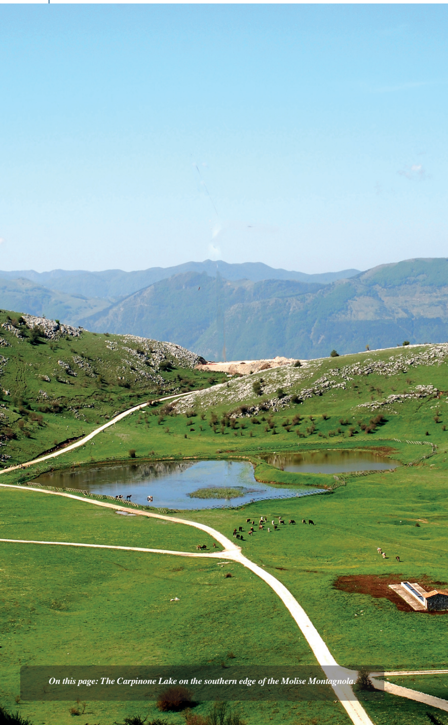
On this page: The Carpinone Lake on the southern edge of the Molise Montagnola.