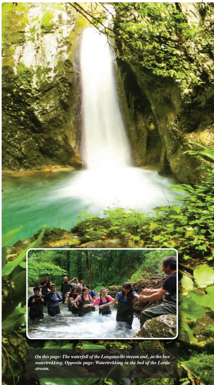
On this page: The waterfall of the Longaniello stream and, in the box waternetrekking. Opposite page: Waternetrekking in the bed of the Lorda stream.