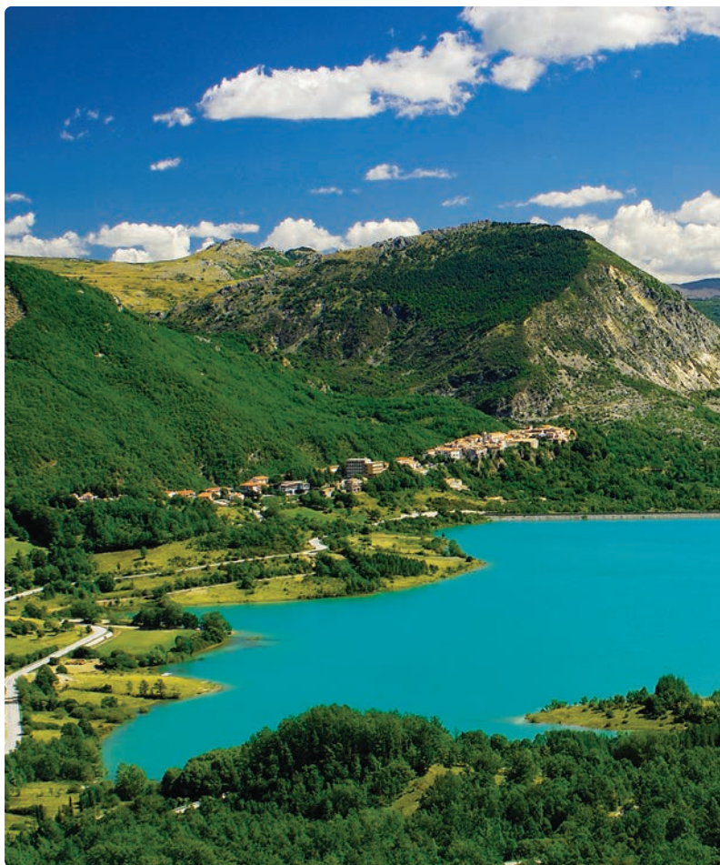
Total view of the artificial basin of Castel San Vincenzo.